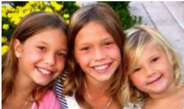
Team Tourette Syndrome's "Hoop Girls"

We are participating in Hoop-A-Paluzas day of fun and basketball to raise money for very worthy causes including NJCTS. Hoop-A-Paluzas, Inc. has donated to our school in-service program in the past and in 2009 will help fund Camp Bernie and a new South Jersey TS Family Retreat.